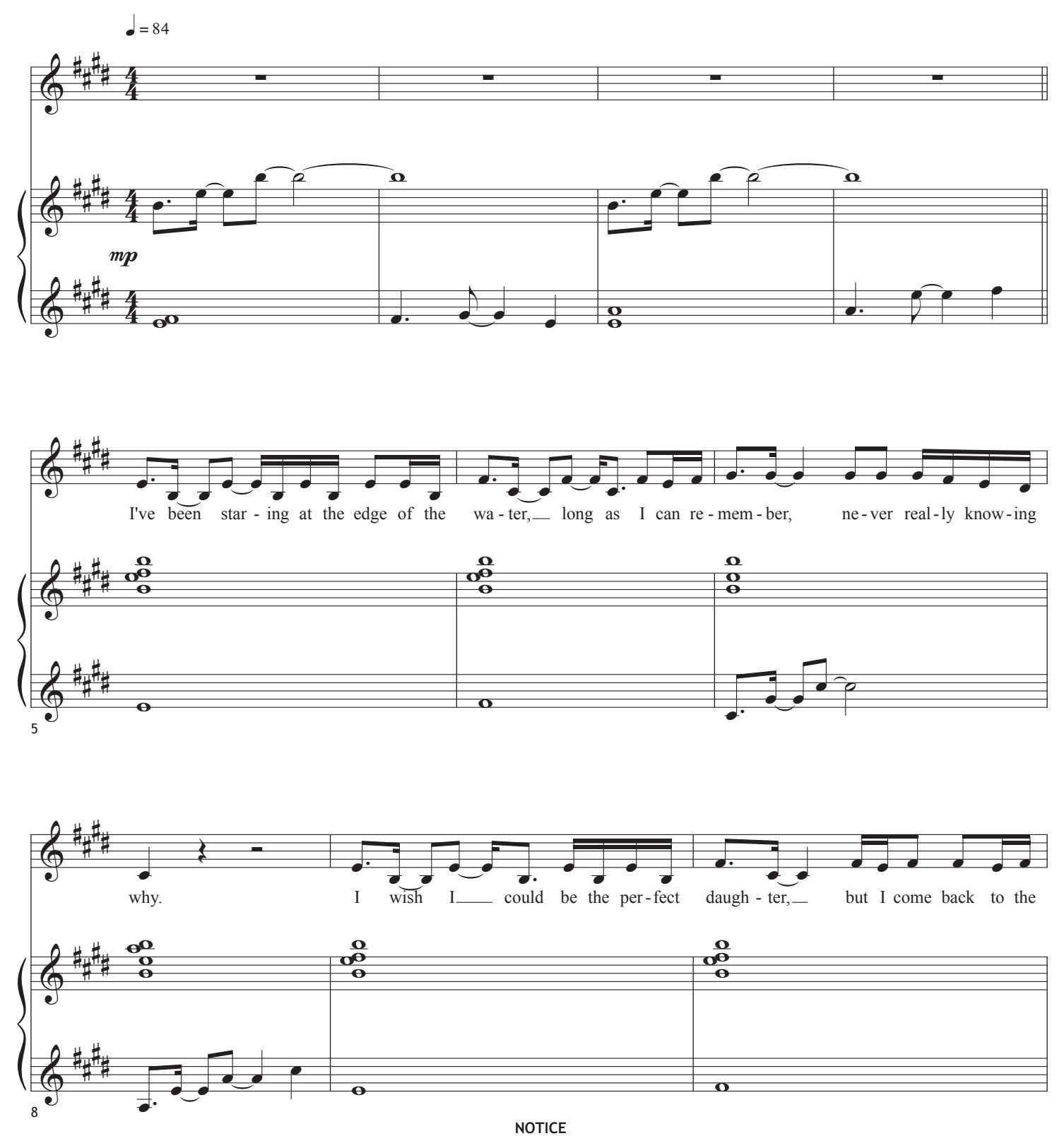
This material, and all concepts, ideas and information contained herein, are confidential and are the property of the Walt Disney Company. This material, including the concepts, ideas and information contained herein, shall not be published, broadcast, reproduced, disseminate, disclosed or used in any form or by any means, in whole or in part, without prior express written permission of the Walt Disney Company. All rights reserved. © Disney